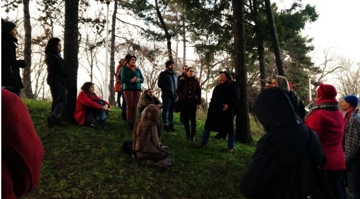
First place: Under the “Douglastree-Cathedral”, higher area in Tineretului-Park, 03. Feb. 2018