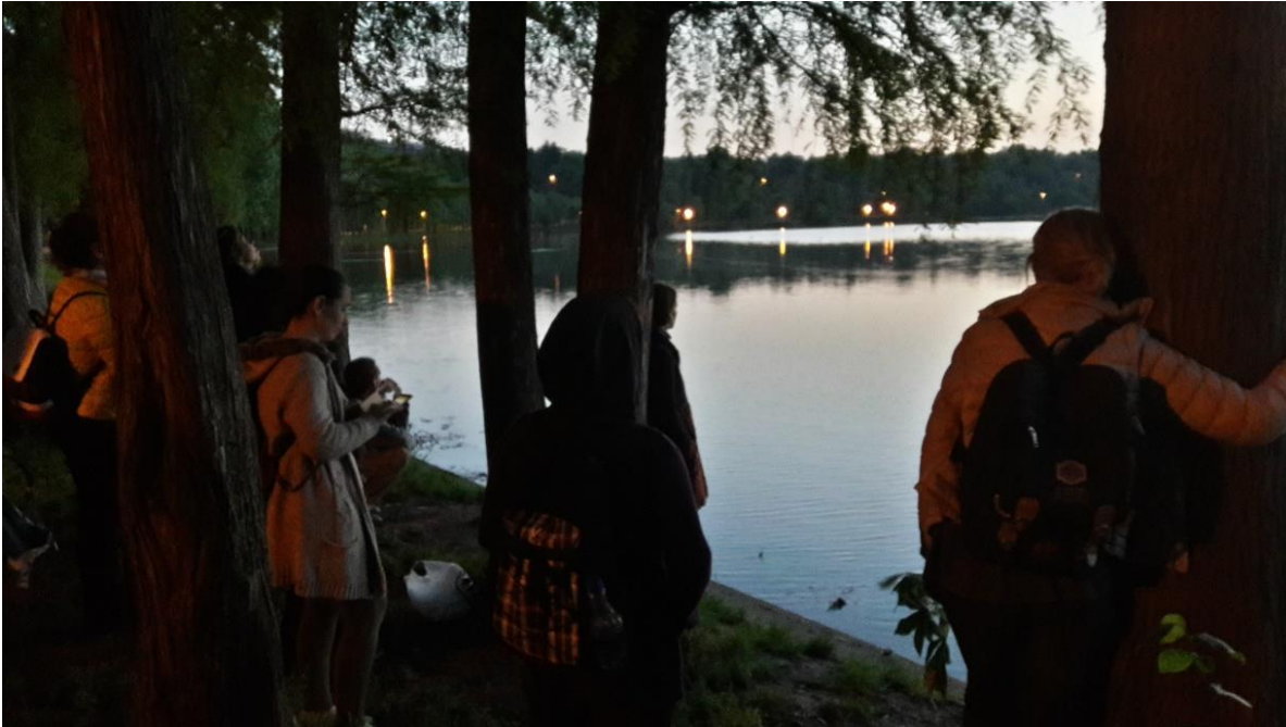
The third place: The last little Ciparos-Forest at the Lake on our tour, Spring 2017

For them who can visit the park again, it can make sense to take this descriptions with you and to observe meditatively this places again, best near Sundown again, and compare with your experiences and changings in them with this decriptions! This can become a meaningful personal spiritual habit too (which is intended as a part of our “homeworks”/development works! So the park is a good “parcour” for inspirational Walks for them who live in Bucuresti and cannot reach good wild nature (if ever possible visit the places at 30 th December and/or NewYears Eve Evening!).”