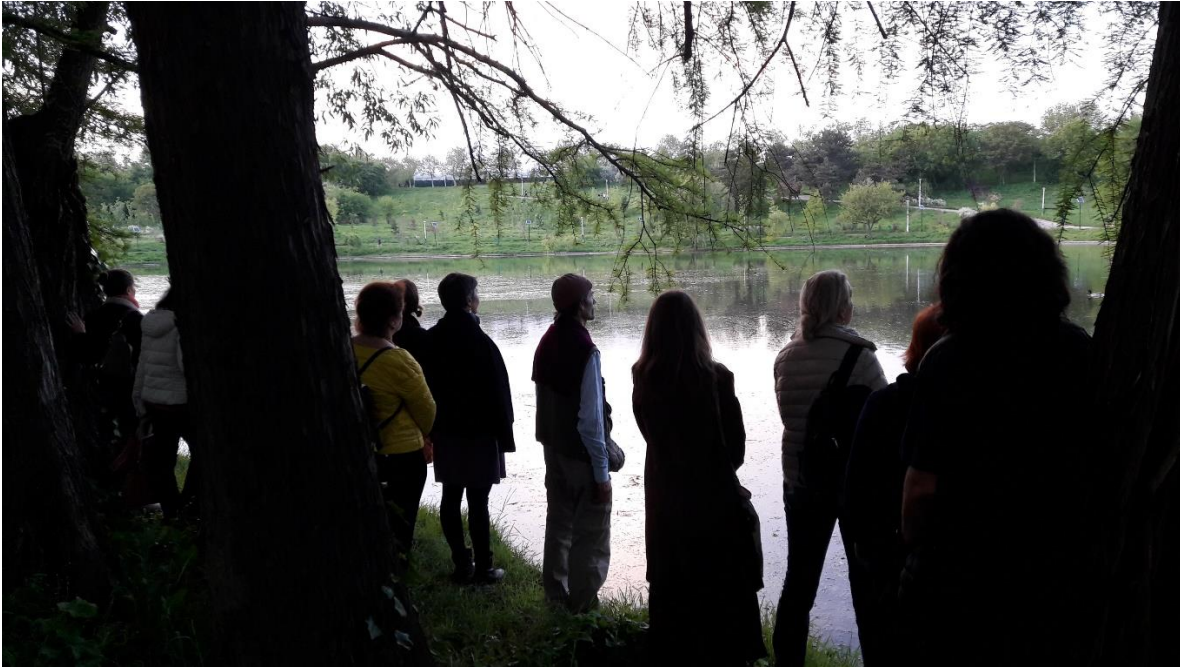
Second place: The “Innerness Place” under Ciparos-Trees at the lake, Spring 2017