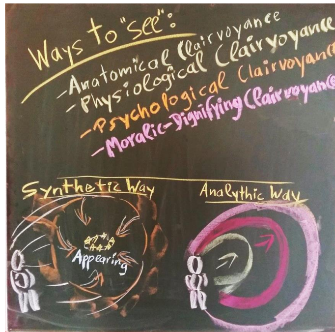
Boardpicture the ways of supersensible perception, Bucuresti 02 nd February 2018

The supersensible- or clairvoyance perception of a being – and everything has at last a being as its inner origin –, even if it always needs empathic abilities, can happen in general through accesses with a more anatomical grasping, a more physiological grasping, a more psychological empathy or a morally-dignifying attitude with maybe religious dedication forces.